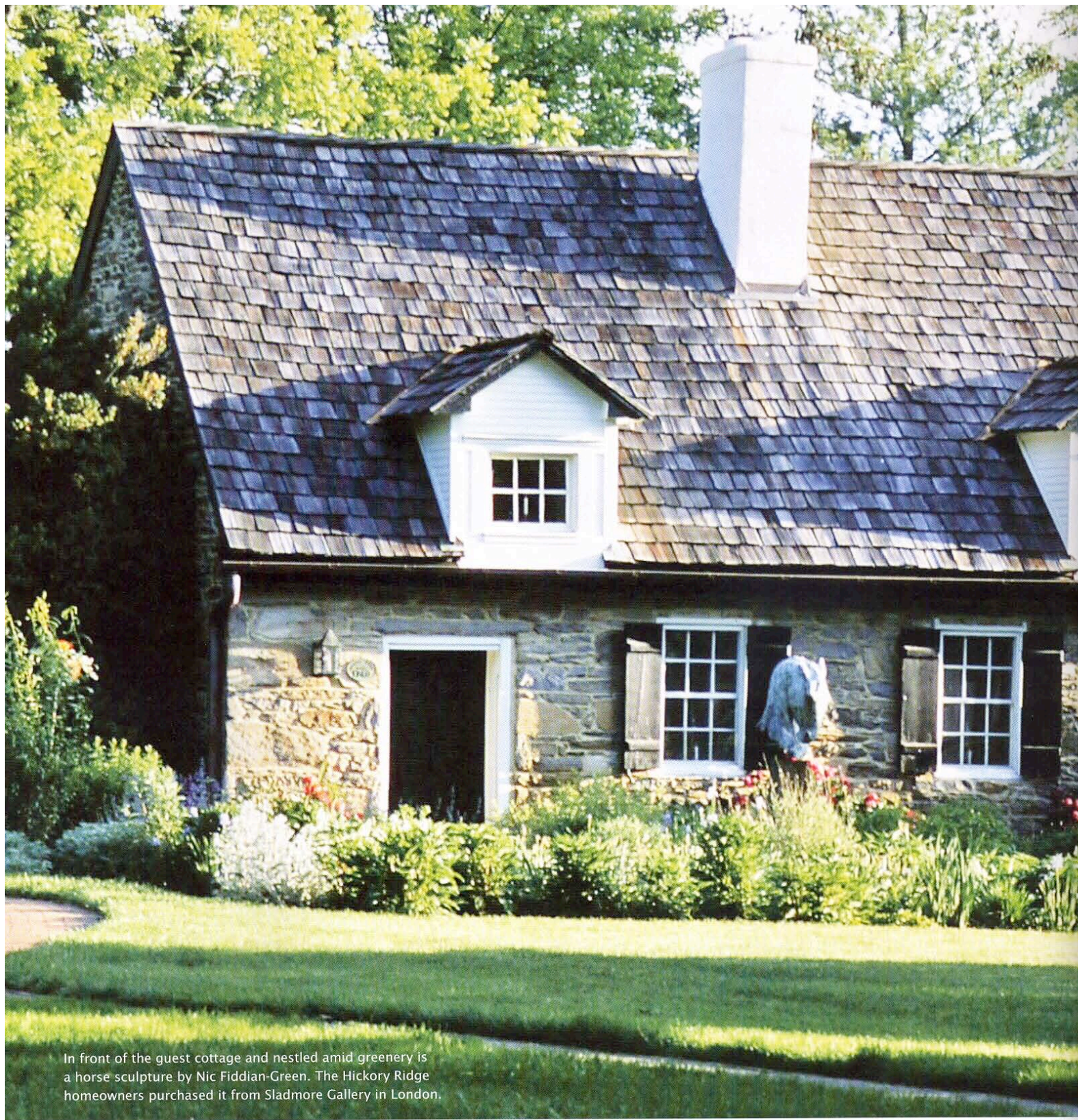
In front of the guest cottage and nestled amid greenery is a horse sculpture by Nic Fiddian-Green. The Hickory Ridge homeowners purchased it from Sladmore Gallery in London.