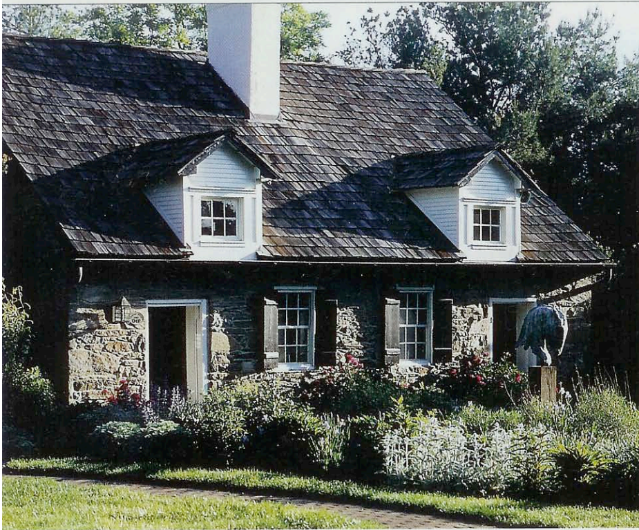
The grounds around a client's historic cottage get a garden design that might have been there when the house was first built.

worlds, being sustainable and being about place are one in the same," says Graham.